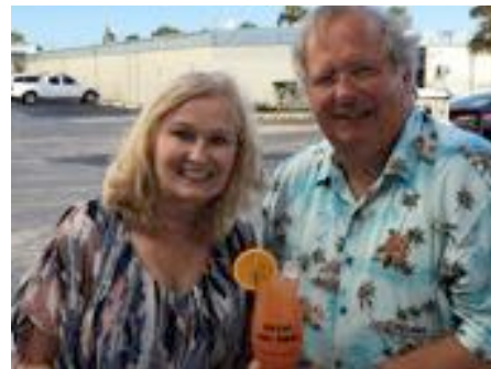
Hurricanes served in souvenir glasses.