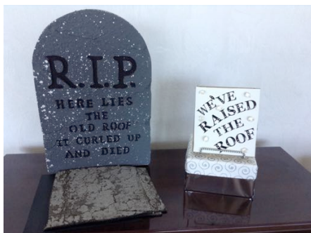
Decorations made from old & new roof pieces.